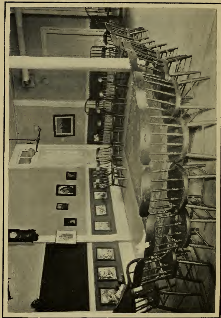
A dingy furnace room transformed into a room for the Beginners' department by painting the woodwork white, the floor stone-color, the walls pale blue, hanging permanent pictures low, adding a burlap dado for story pictures, and encasing the furnace pipe in a tin jacket painted white